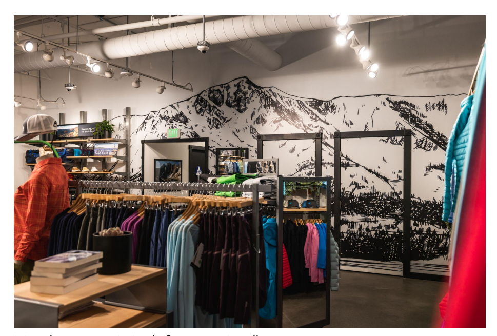
Stio Tahoe Mountain Studio® - Mountain Tallac