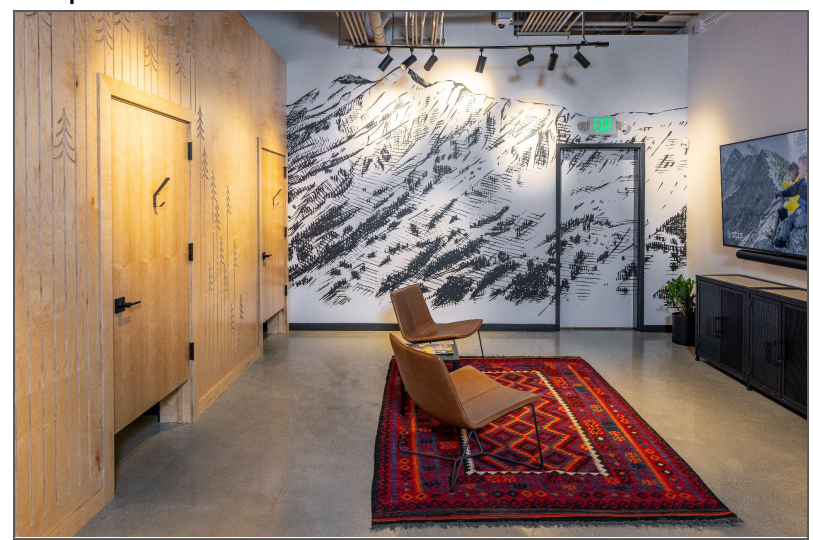
Stio Bozeman Mountain Studio® - Bridger Bowl